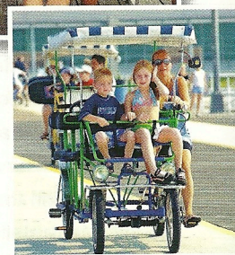
Cape May County Tourism Photos

O n the southeastern coast of New Jersey, the Wildwoods are one of the Jersey Shore's premier vacation spots, a perfect destination for group travel with plenty of options for relaxation and recreation. Known for its boardwalks and beaches, the Wildwoods invites groups to walk along the pier, go on rides, and enjoy the sand and surf.