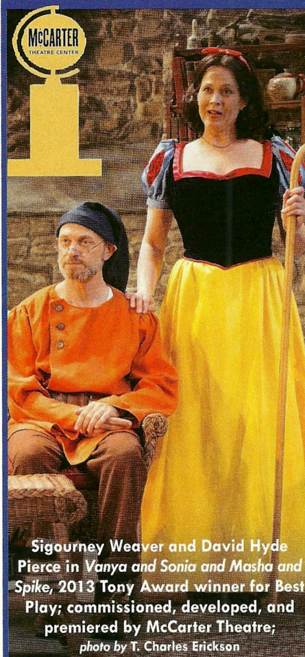
Sigourney Weaver and David Hyde Pierce in Vanya and Sonia and Masha and Spike, 2013 Tony Award winner for Best Play; commissioned, developed, and premiered by McCarter Theatre

known for innovation, artistic excellence, and affordability in the heart of historic Princeton, NJ.