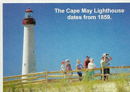
The Cape May Lighthouse dates from 1859.

Another place to view wildlife is the Cape May County Park and Zoo . The free-admission park features some 250 species of animals and includes picnic areas, nature trails, playgrounds and bike paths. Nearby is Leaming's Run Gardens with its themed gardens and re-created colonial farm.