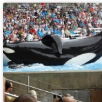
Movie review: Blackfish