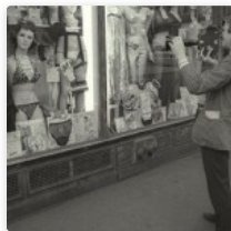
Movie review: The Fall