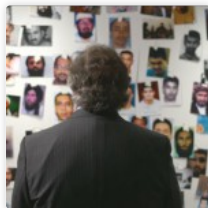
Movie review: Manhunt

Tagged with: Beofilm Post Production • Columbia • CoMo • daniel dencik • doc • Documentaries • Documentary • downtown como • expedition to the end of the world • festival • film • Greenland • Minik Rosing • movie • movies • schooner • T/F • T/F Film Festival • True/False • True/False Film Festival