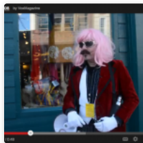
Vox Asks T/F: What Documentaries Have You Seen?