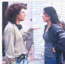
Panel recap: Revolving Doors