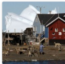
Movie review: Village at the End of the World