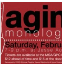
The Other V-Day: the Vagina Monologues hit the MU stage Saturday