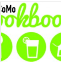
The CoMo Cookbook: Geisha Sushi Bar