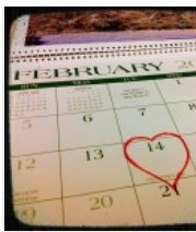
Why make out when you can order take out!