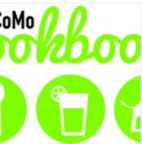
The CoMo Cookbook: Geisha Sushi Bar