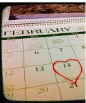
Why make out when you can order take out!