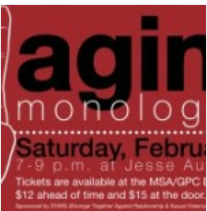
The Other V-Day: the Vagina Monologues hit the MU stage Saturday