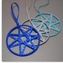
MidMo Etsy: Cherie Price and Green Owl Curiosities