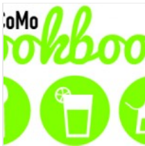
The CoMo Cookbook: Geisha Sushi Bar