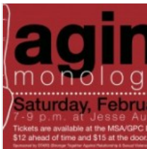
The Other V-Day: the Vagina Monologues hit the MU stage Saturday