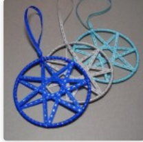
MidMo Etsy: Cherie Price and Green Owl Curiosities