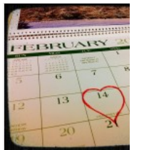
Why make out when you can order take out!