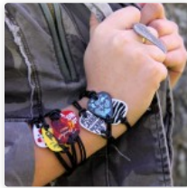
MidMo Etsy: Lesley Held and Rock Steady Couture

Tagged with: craft • etsy • glass • jewelry • pets • wood clock