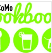
The CoMo Cookbook: Geisha Sushi Bar