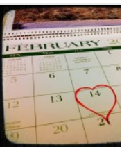
Why make out when you can order take out!