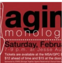
The Other V-Day: the Vagina Monologues hit the MU stage Saturday