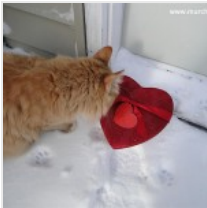
Love birds: there are actually 13 Valentine's Days in a year