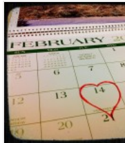
Why make out when you can order take out!