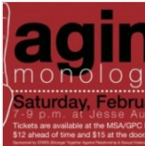
The Other V-Day: the Vagina Monologues hit the MU stage Saturday