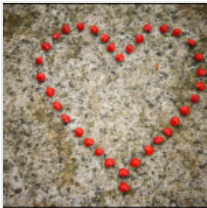
ways to celebrate Valentine's Day with your cyber honey