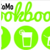
The CoMo Cookbook: Geisha Sushi Bar