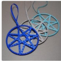
MidMo Etsy: Cherie Price and Green Owl Curiosities

Tagged with: bartolacci designs • bracelet • etsy • jewelry • necklace