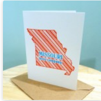
Missouri crafts on Etsy