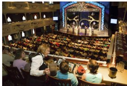
Dinner show on the Showboat Branson Belle.