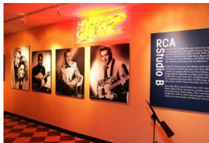
RCA Studio B.

check out the Schermerhorn Symphony Center , Vanderbilt University's Blair School of Music and the Nashville Jazz Workshop . Music festivals for students to enjoy include the Music City Jazz, Blues and Heritage Festival, Americana Music Festival, and the Music City Festival and BBQ Championship.