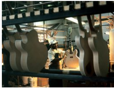
Crafting a guitar at the Gibson Guitar Factory.