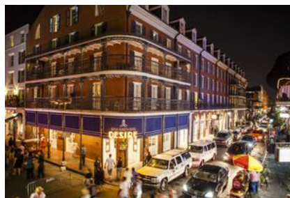
Royal Sonesta in the French Quarter.

Many opportunities await students in this city known for its jazz. The Louisiana Philharmonic Orchestra has open rehearsals throughout the year that students can observe; rehearsals this year include Don Quixote and Beethoven's Fifth. Southern Repertory Theatre involves the students with a matinee performance that afterwards gives them the chance to ask questions to