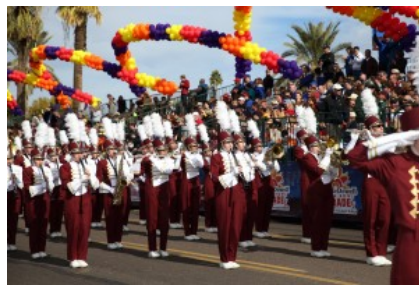
The Fiesta Bowl Parade.

The Fiesta Bowl Band Championship held in conjunction with the parade is one of the top running events in the Fiesta Bowl Festival of Events. It is the only major bowl game with judged bands. The event is known to be one of the most prestigious high school band competitions in the U.S. Eight bands advance in pursuit of the Grand Marshal's Trophy. The Fiesta Bowl has hosted highly rated bands from 44 states. The field show is held at the University of Phoenix Stadium in Glendale, Arizona.