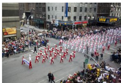
Macy's Thanksgiving Day Parade.

During the band's visit, students can attend a Broadway show, take a harbor cruise to view the Statue of Liberty or see others perform at Carnegie Hall, Radio City Music Hall or Lincoln Center.