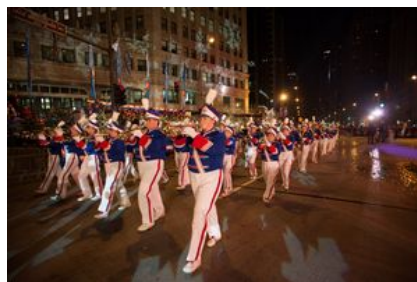
Image from the 21st Annual BMO Harris Bank Magnificent Mile Lights Festival© 2012.

Students get a chance to march along Chicago's Magnificent Mile on Michigan Avenue to start the holiday season on Nov. 23. The Magnificent Mile Lights Festival features an evening parade with lighted floats, balloons and characters from Walt Disney World Resort. The parade is limited to five or six marching bands.