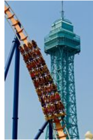
Dominator Roller Coaster Near the Eiffel Tower, Kings Dominion

A 300-foot replica of the Eiffel Tower stands in front of this 400-acre theme park near Richmond. It features live shows, thrill rides, and a water park. It has 15 roller coasters, including the Intimidator 305, a mega coaster with a height of 305 feet and speeds up to 90 mph. The Dominator is said to be the world's longest floorless coaster at 4,210 feet. The Grizzly is a wooden roller coaster based on Coney Island's Wildcat coaster. The Incredible Hulk Coaster is a coaster that rockets out of a volcanic crater. The park also features a lazy river and a slide that sways back and forth called the Tornado, extending 65 feet into the air.