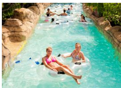
Morey's Piers River Adventure at Raging Waters Waterpark.

The second park, Mariner's Landing Pier, offers a 156-foot-tall Ferris wheel with an addition of LED lights for 2013. The Sea Serpent roller coaster reaches speeds of 55 mph