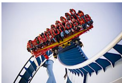
Busch Garden's Griffon.

This well-known amusement park is perfect for teens and young adults because of its diversity. The 100-acre, European-themed park features aspects of England, Scotland, France, Germany, Italy and Ireland. It offers 23 rides, nine main stage shows and a 4-D movie. One of the popular roller coasters, the Griffon, claims to be the world's tallest, floorless roller coaster, climbing 205 feet and traveling at speeds up to 75 mph. Another popular coaster is Apollo's Chariot, which rides over nine humps. The Loch Ness Monster coaster loops at 13 stories tall and can go as fast as 60 mph. Students who do not like roller coasters can enjoy tamer rides, shows and animal exhibits.